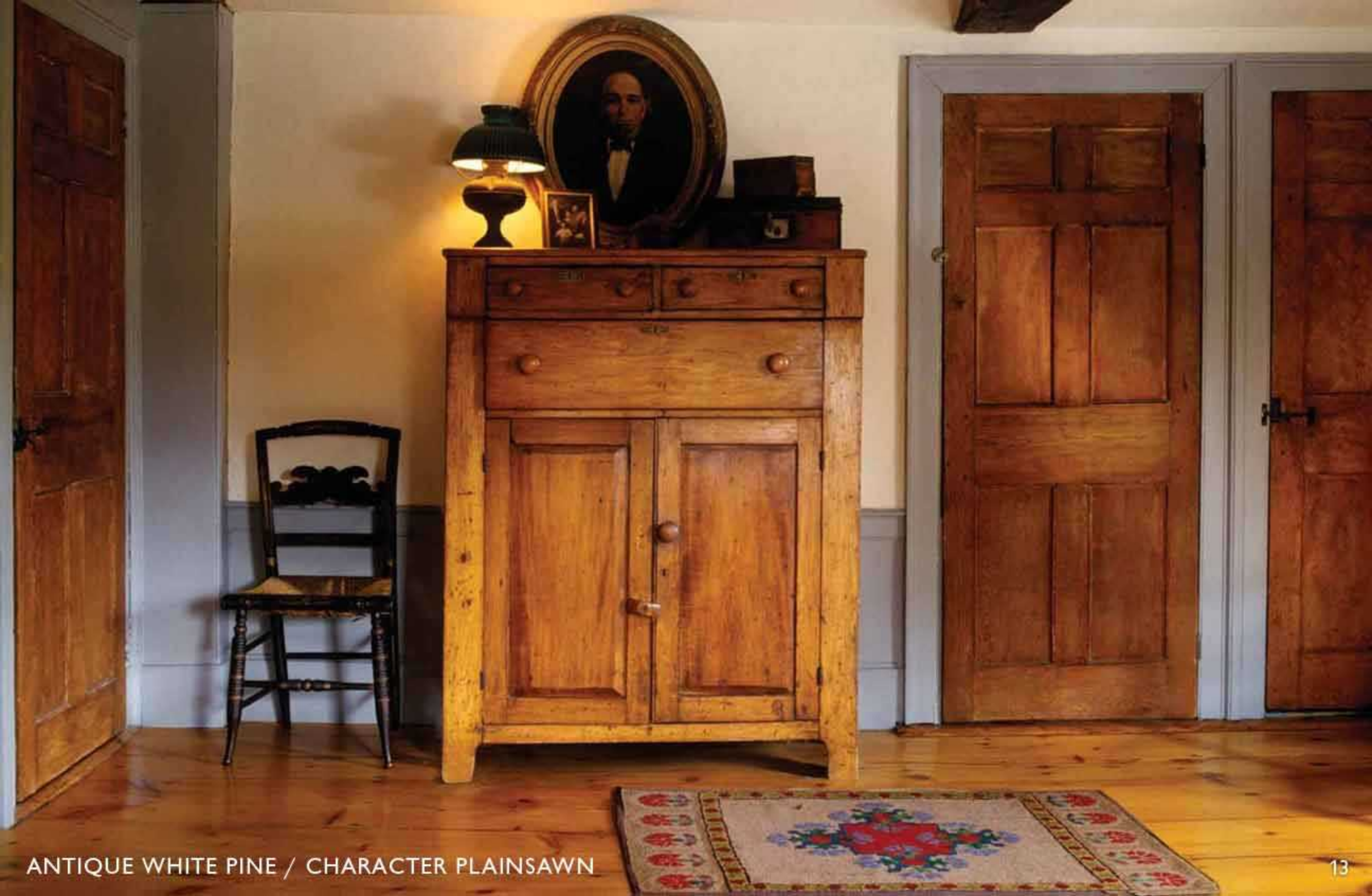
ANTIQUE WHITE PINE / CHARACTER PLAINSAWN