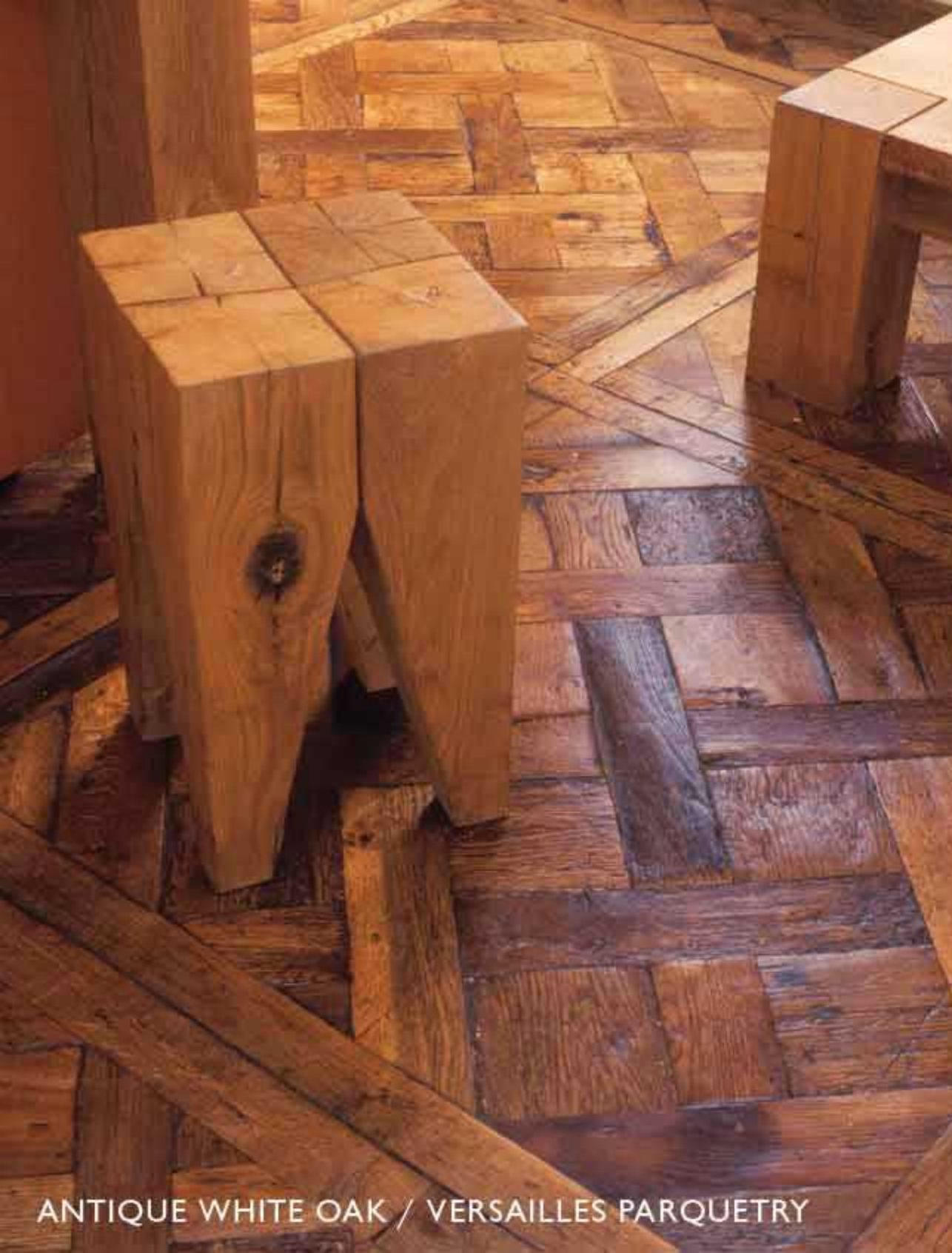
ANTIQUE WHITE OAK / VERSAILLES PARQUETRY