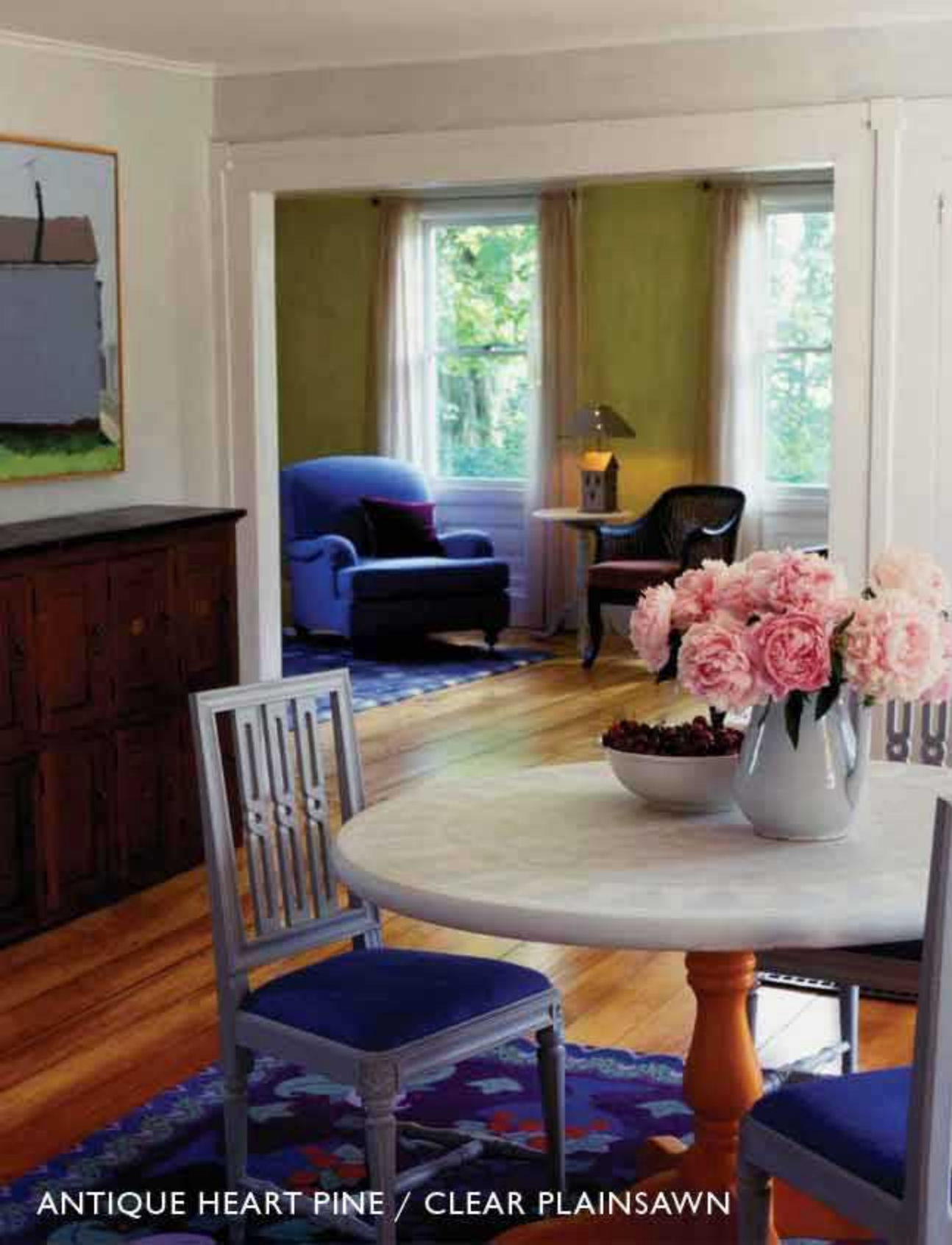
ANTIQUE HEART PINE / CLEAR PLAINSAWN