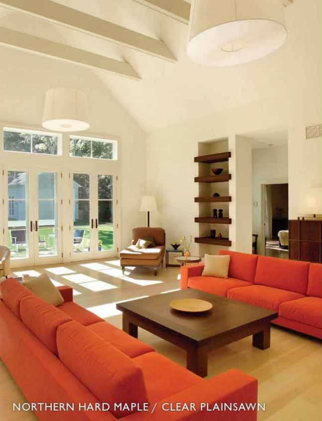
NORTHERN HARD MAPLE / CLEAR PLAINSAWN