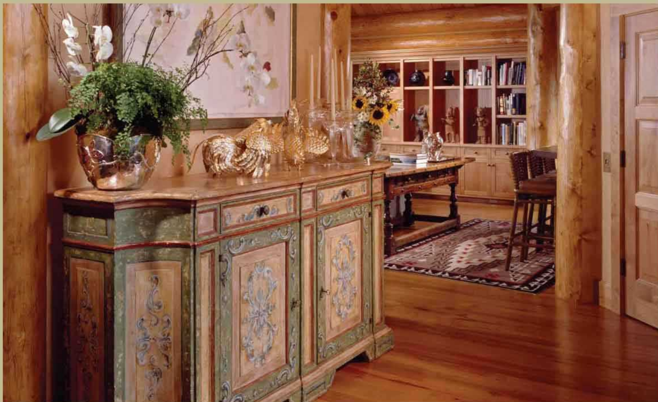
ANTIQUE HEART PINE / PERFECTION QUARTERSAWN