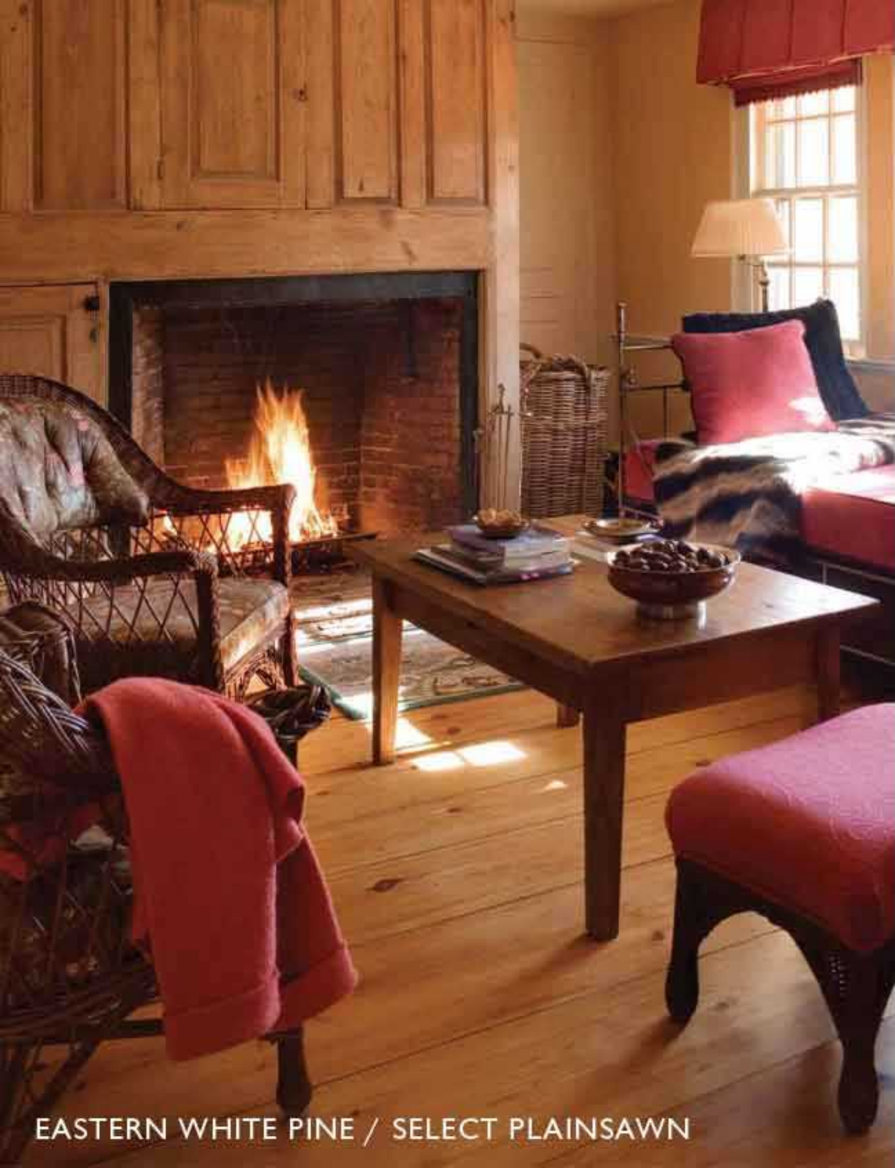
EASTERN WHITE PINE / SELECT PLAINSAWN