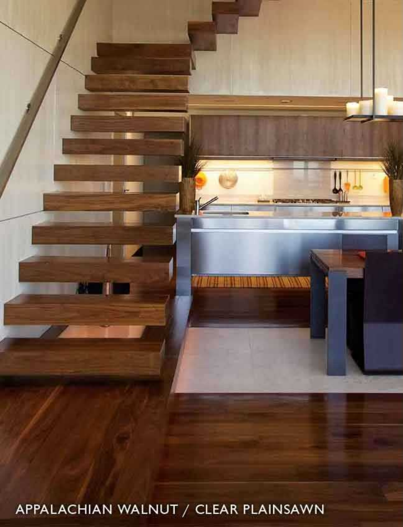
APPALACHIAN WALNUT / CLEAR PLAINSAWN